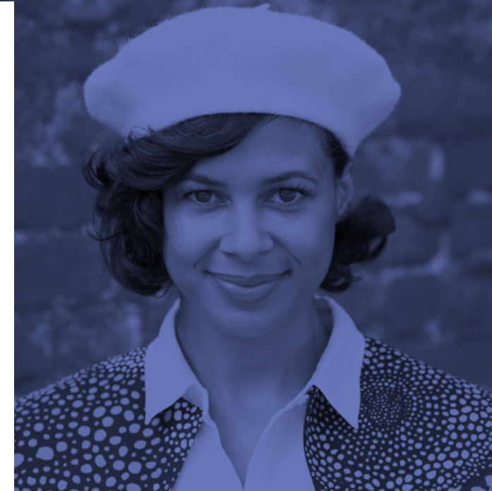
GW Chew Founder Something Better Foods